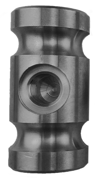
Brass Hammer Head